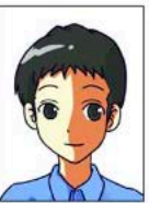
Shadow over the face