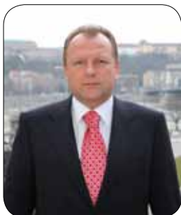
Marius L. VIZER IJF President